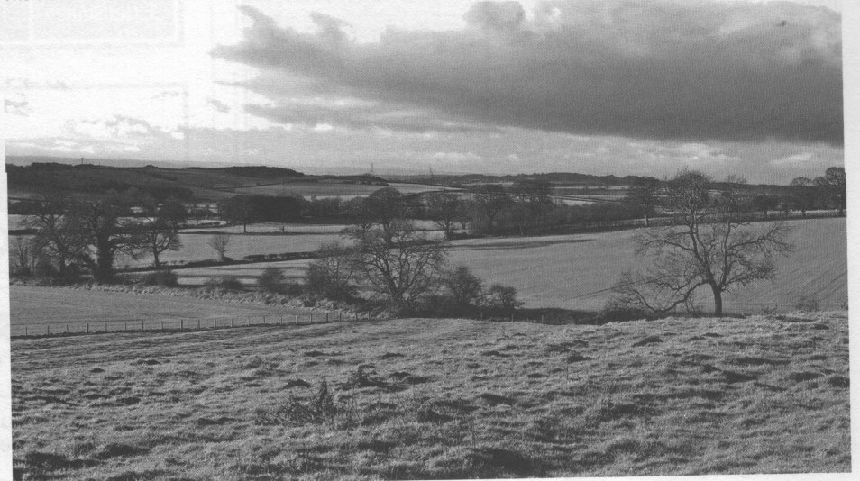
The view south west before crossing the March Burn at 11

Take the minor road North until you reach the crossroads ⑫ carefully cross the Military Road as the traffic can be travelling fast and head towards Whitchester. Reaching Pipers View, ⑬ spend a few minutes to take in the view in all directions. Continue past Pipers View until the road bends left, take a right hand turn ⑭ and follow the farm track up the side of the field. At ⑮ you can turn left a take the alternative route and follow the finger signs to Turpins Hill home to Barnacres Alpacas. Our route turns right at ⑮ along the side of the field following the track taking in another viewpoint ⑯ before heading downhill until you reach the Stamfordham Road ⑰. Take care crossing the road and head down 'Green Lane' until you come to Heddon House and Halls of Heddon Nurseries ⑱. Follow the road towards the A69 until you come to the finger post at ⑲ take the path down into the small wood that goes alongside the dual carriageway until you come to a gate at ⑳. Turn right and head towards Heddon going through the tunnel under the A69 and along the farm track (which can be very muddy and heavy underfoot when wet, as far as Bays Leap Farm) until you come to the junction of the B6138 and the B6528 ㉑ at the Three Tuns. Cross the roads and back to the start.