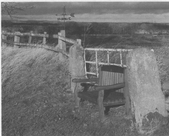
Pipers View - The seat and weather vane, looking towards Simonside.