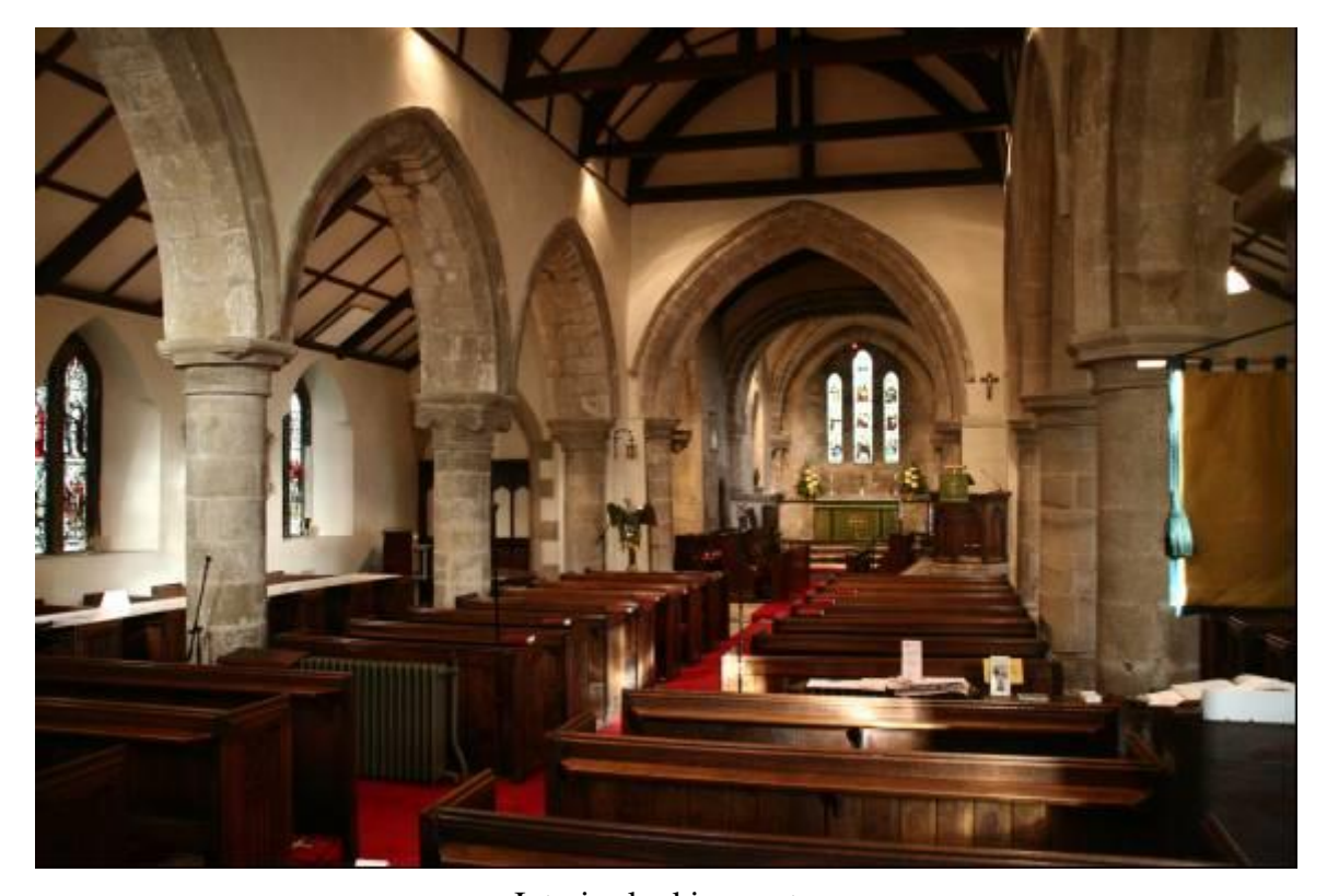
Interior looking east

In the South Aisle the south door has a taller two centred rear arch, with only west jamb splayed and shouldered; at the east end of the wall is a small square-headed recess behind plaster, but without any exposed detail. The North Aisle has no medieval features; at its east end is a 19<sup>th</sup>-century arch to the Organ Chamber, two-centred and of two chamfered orders, the inner order dying into the jambs and the outer continued down to the south jamb to a stop just above floor level.